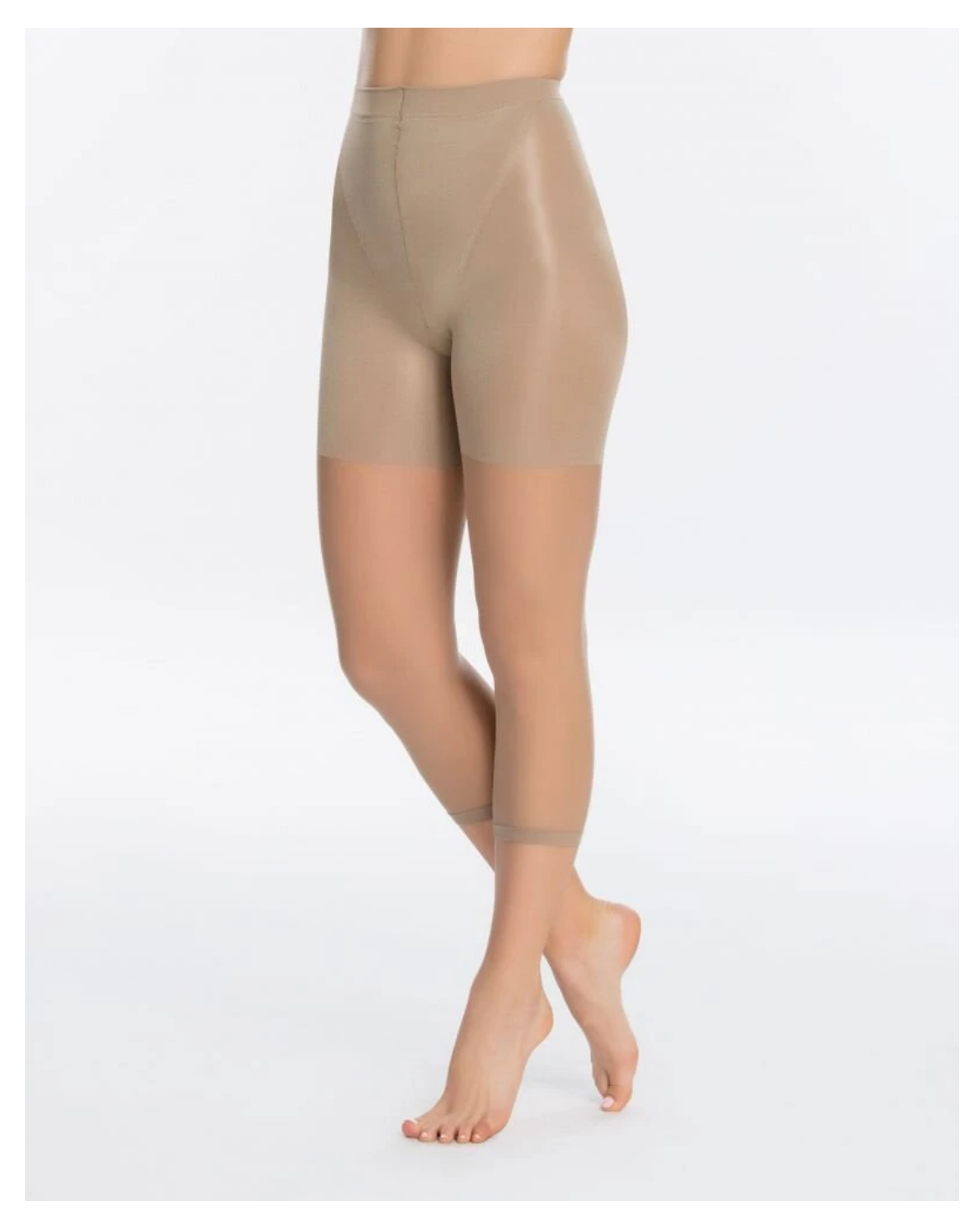
Spanx Power Capri

If you're wearing a fitted dress, pay attention to the seams of your foundation. "Undergarments like corsets and long-line bras don't suit mermaid and trumpet silhouettes because the lines of the shapewear can be seen under the fabric, so strapless bras are usually the better choice for these dress styles," Ms. Kaplan said. Wear a strapless bra that gives you enough lift and support, like Wacoal's Red Carpet Strapless Full Busted Underwire Bra ($68). You can also consult with your seamstress about the possibility of adding boning or cups for structure and lift.